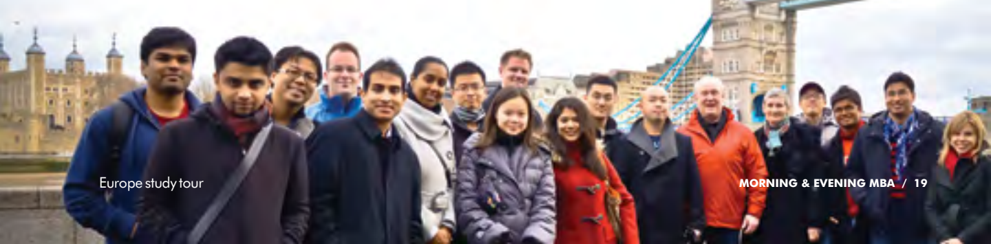
Europe study tour