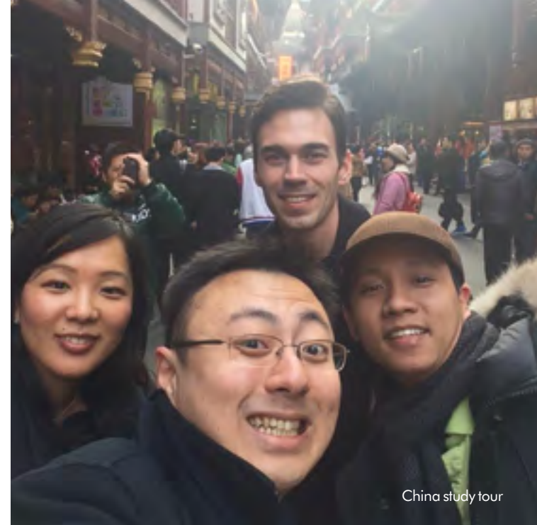
China study tour